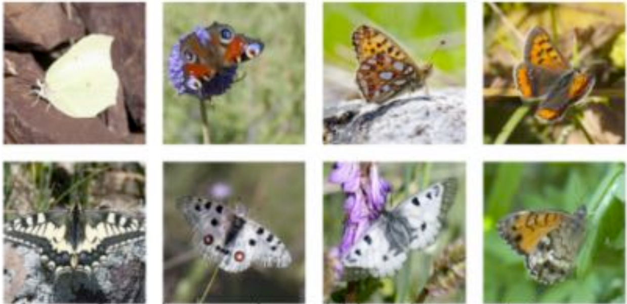
Photographs from the Lapis Guides “Butterflies of Kyrgyzstan” digital field guide