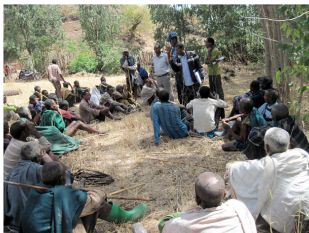
FIGURE 3 | Discussing ecosystem degradation resulting from farmers whose land surrounding the rehabilitated gully being unwilling to share the grass in the Tana Lake Region, Ethiopia.

Traditionally, water resources were exclusively used for irrigating croplands (through canals) and managed by cooperative management practices among local communities (Messerschmidt, 1986). More recently, there are competing demands from domestic use, hydropower generation and cultural significance (National Trust for Nature Conservation, 2008). Furthermore, there is an increasing water stress due to changes in snowfall and rainfall. The available water resource became highly contested resource among individuals, communities and social groups (National Trust for Nature Conservation, 2008). To adapt