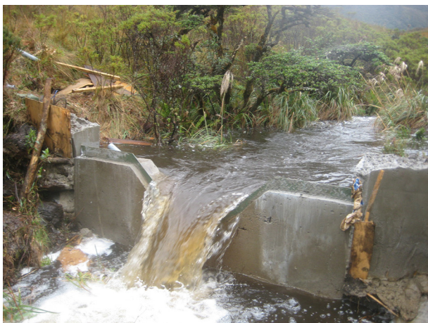
FIGURE 2 | V-notch weir for river flow measurements installed as part of the iMHEA monitoring network in the Peruvian Andes.

A main problem is the disconnect between the governmental or donor recommended practices and what farmers are willing to maintain voluntarily without governmental interventions. For instance, government agencies recommend the installation of 60 cm deep and 30–40 cm wide swales on the contour to intercept excess rainfall and to allow it infiltrate into the subsoil. In contrast, the indigenous soil conservation practice is to plow small 10–15 cm furrows just off the contour to transport the excess rainfall,