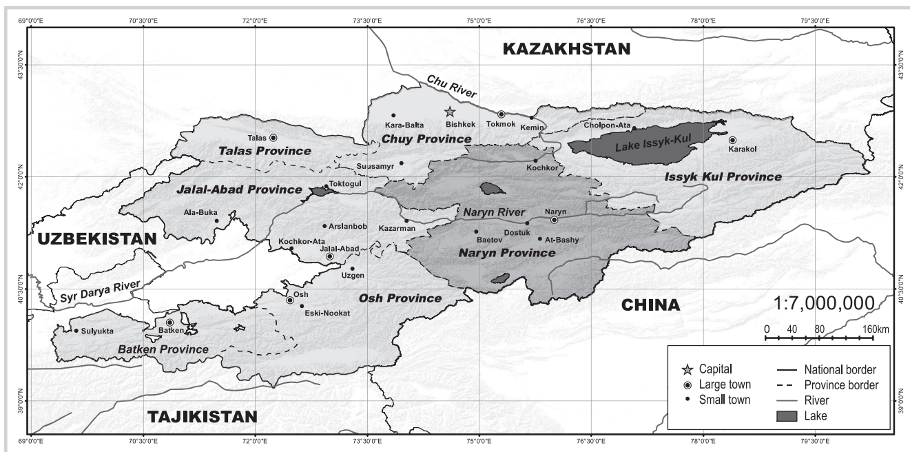
FIGURE 1 Naryn Province in Kyrgyzstan. (Map by Evgenii Shibkov)

Bordering China in the south, Naryn Province also remains part of the Silk Road, because it is situated on a major trade route that connects China with Eurasia and thus links demand and opportunity, for both local and regional trade, particularly in terms of livestock and livestock products.