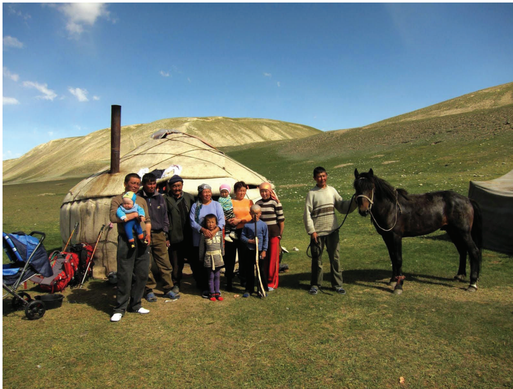
FIGURE 2 A family portrait in the jailoo (summer pasture) in Kyrgyzstan.

stay. Thus, herders have the most immediate impact on livestock and pasture productivity.