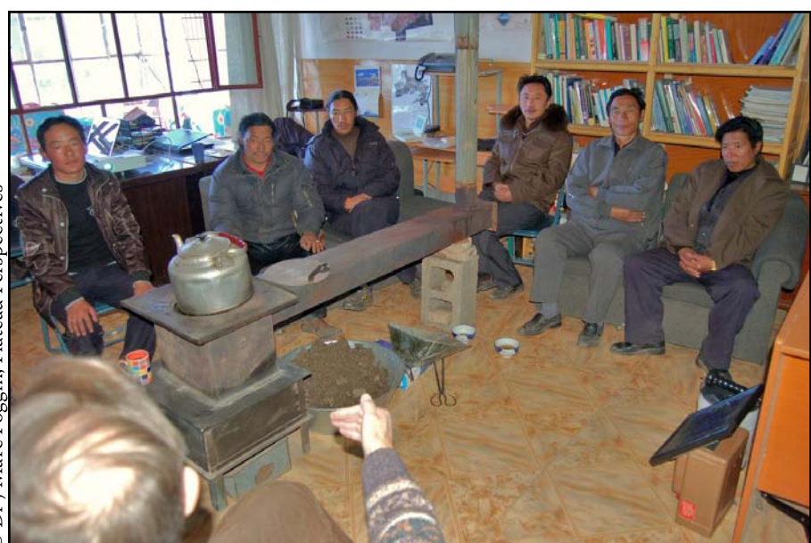
Workshop with local herders and nature reserve field staff on use and installation of solar-powered electric fencing (SPEF) and camera traps, 28 October 2009

contrast, during the same period, another house around 30 metres away was damaged by brown bear on at least two separate occasions. Likewise, according to the village leader, all 26 families in the village who had moved with their livestock to their summer pastures, leaving their homes unattended, also had their property damaged by bear while they were away (the village is comprised of 58 families in total). Damage to herders' homes by brown bear occurred throughout the village area between April and October 2009, with the exception of the trial home protected by electric fencing.