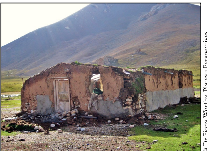
House destroyed by Tibetan brown bear

tion in its prey species, most notably plateau pika (Ochotona curzoniae) due to a recent, multi-year, large-scale pika eradication policy (Hao 2008). Around 70 percent of the brown bear diet is comprised of pika (Xu et al. 2006). Even partial removal of pika from the grassland ecosystem would likely have serious impact on brown bear, leading to a forced shift in diet intake. Brown bear may thus have begun to search more widely for alternative sources of food, including entry into local herd-