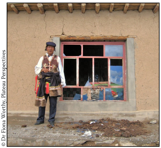
Window broken by Tibetan brown bear

behavior over the past decade or so, taking advantage of the occasional but significant food returns that can be obtained by breaking into herders' homes, i.e. 'warehouses' that did not exist before the government began to subsidize construction of winter homes (Foggin 2008).