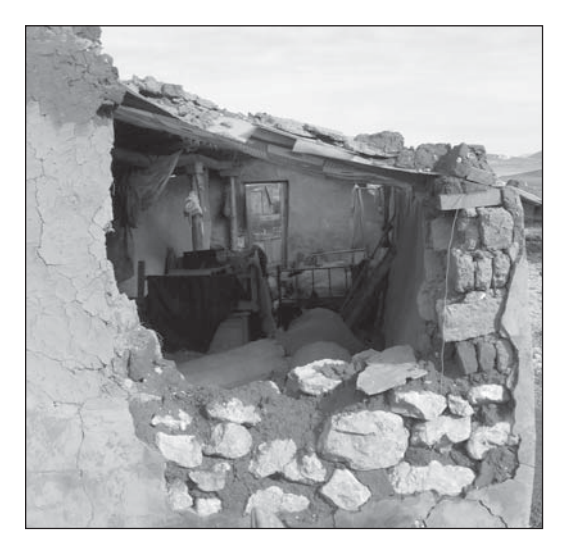
Figure 2 b.

(Foggin 2000, 2005, 2008), and their support for conservation efforts remains invaluable. However, the case of bear attacks in the Tibetan Plateau region illustrates that the human cost of conservation can be high for local villagers and could eventually erode their support. Community co-management of wildlife aims to benefit both people and wildlife by addressing development and conservation in tandem (Cooke and Kothari 2001, Pound et al. 2003, Borrini-Feverabend et al. 2004). To date, such co-management has been manifest primarily in the form of focus group discussions (with representatives from local communities) and community meetings involving higherlevel government authorities. Ultimately, all key stakeholders must be considered, and government policy must be applied in ways appropriate to the local ecological and cultural situation for conservation efforts to succeed (Cotton 2008, Lemelin 2008). There appears now to be a new and unique window of opportunity for community co-management to be tested in the Tibetan Plateau region. Hosted by Plateau Perspectives, local communities and NGOs already have met together with local and regional government decision-makers on several occasions to jointly discuss and plan future cooperation for the management of natural resources. As of January 2008, a formal long-term agreement has been signed between Plateau Perspectives and the Sanjiangyuan National Nature Reserve to promote community co-management in the region, including the