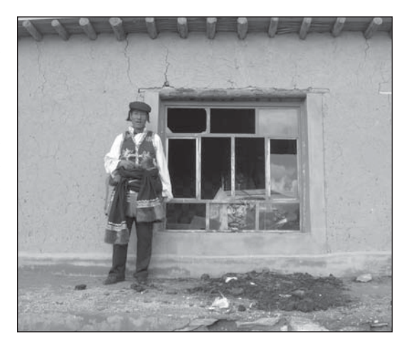
Figure 2. Damaged homes in Lari caused by brown bears. The destruction observed included (a) broken windows, (b) broken walls, and (c) broken furniture.

Everyone at the recent community gathering agreed that the main cause of brown bears attacking winter homes was their attraction to food supplies left inside. However, those who attended the meeting remained divided about the feasibility of carrying all their food supplies with them when they move to their summer pastures. It may, therefore, be most practical to work together with the community to develop a bear-proof container, possibly partially buried in the ground and located near each family's winter home, and to design and introduce solarpowered electric fencing to protect homes from bear attacks. These approaches will be discussed