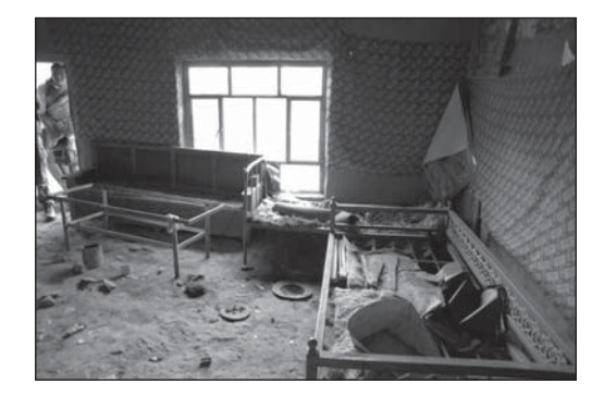
Figure 2 c.

(Foggin 2000, 2005, 2008), and their support for conservation efforts remains invaluable. However, the case of bear attacks in the Tibetan Plateau region illustrates that the human cost of conservation can be high for local villagers and could eventually erode their support. Community co-management of wildlife aims to benefit both people and wildlife by addressing development and conservation in tandem (Cooke and Kothari 2001, Pound et al. 2003, Borrini-Feverabend et al. 2004). To date, such co-management has been manifest primarily in the form of focus group discussions (with representatives from local communities) and community meetings involving higherlevel government authorities. Ultimately, all key stakeholders must be considered, and government policy must be applied in ways appropriate to the local ecological and cultural situation for conservation efforts to succeed (Cotton 2008, Lemelin 2008). There appears now to be a new and unique window of opportunity for community co-management to be tested in the Tibetan Plateau region. Hosted by Plateau Perspectives, local communities and NGOs already have met together with local and regional government decision-makers on several occasions to jointly discuss and plan future cooperation for the management of natural resources. As of January 2008, a formal long-term agreement has been signed between Plateau Perspectives and the Sanjiangyuan National Nature Reserve to promote community co-management in the region, including the